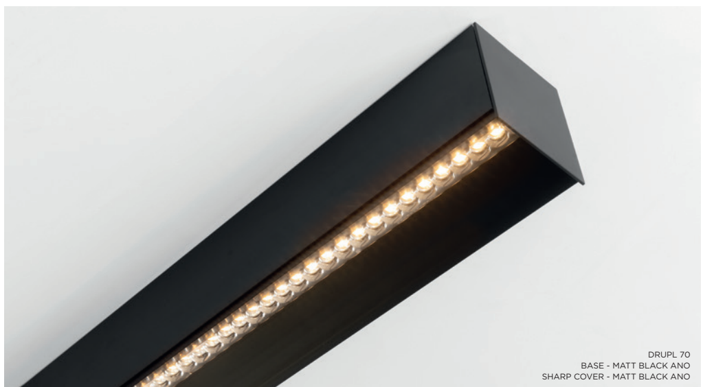
DRUPL 70 BASE - MATT BLACK ANO SHARP COVER - MATT BLACK ANO