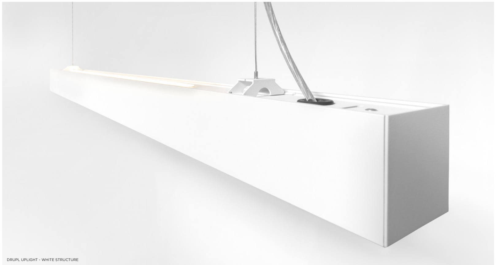
DRUPL UPLIGHT - WHITE STRUCTURE