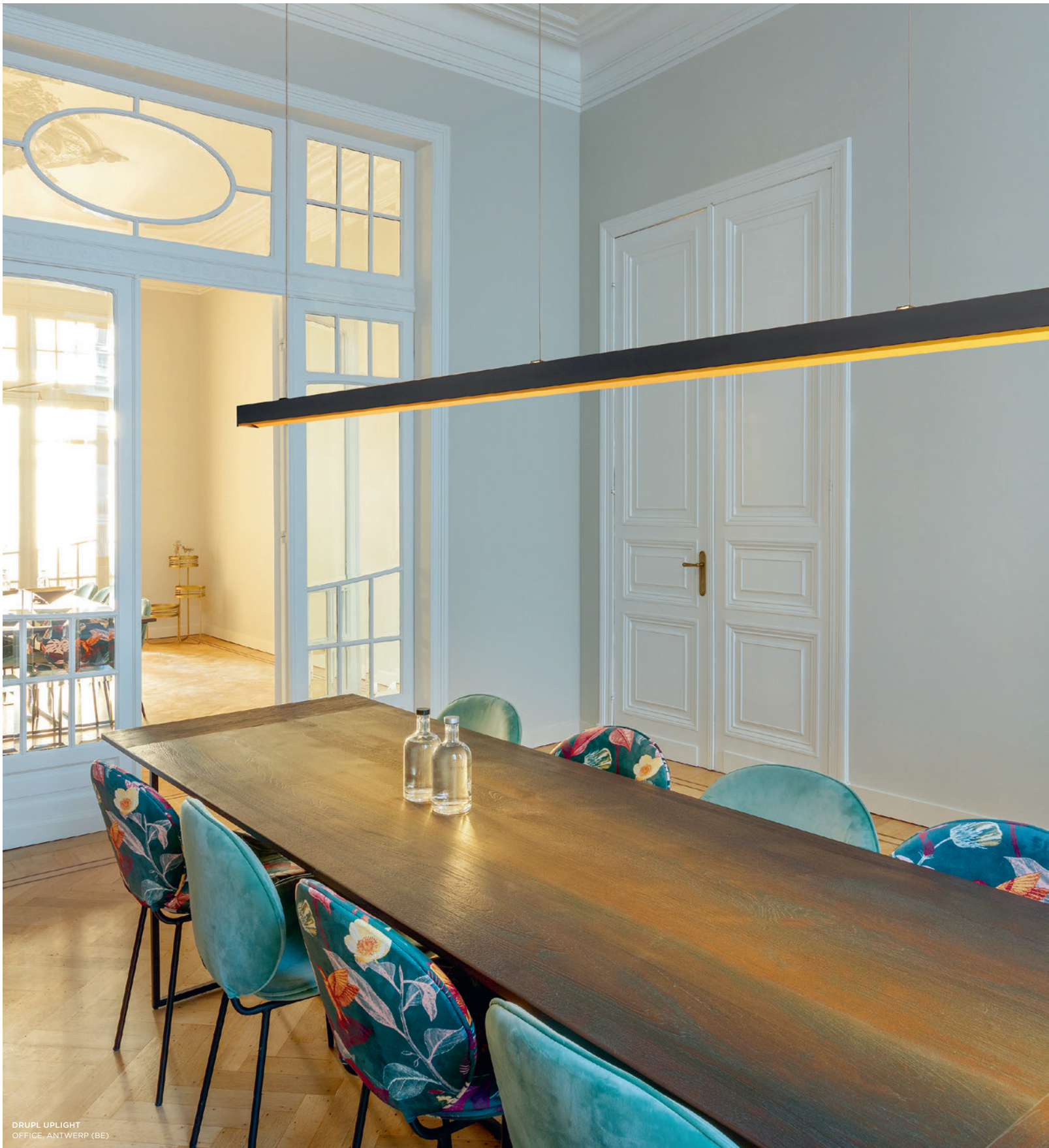
DRUPL UPLIGHT OFFICE, ANTWERP (BE)