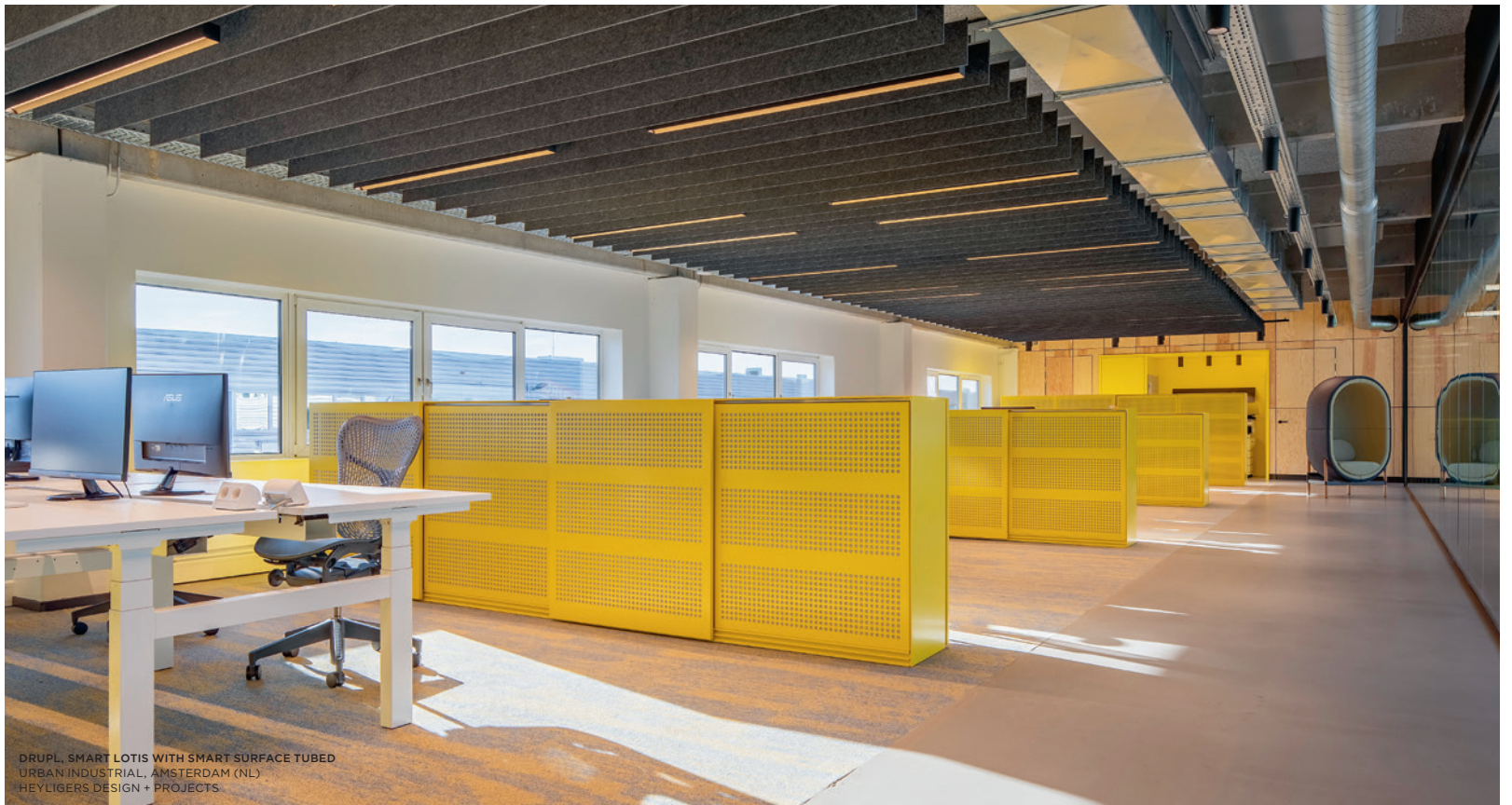
DRUPL, SMART LOTIS WITH SMART SURFACE TUBED URBAN INDUSTRIAL, AMSTERDAM (NL) HEYLIGERS DESIGN + PROJECTS