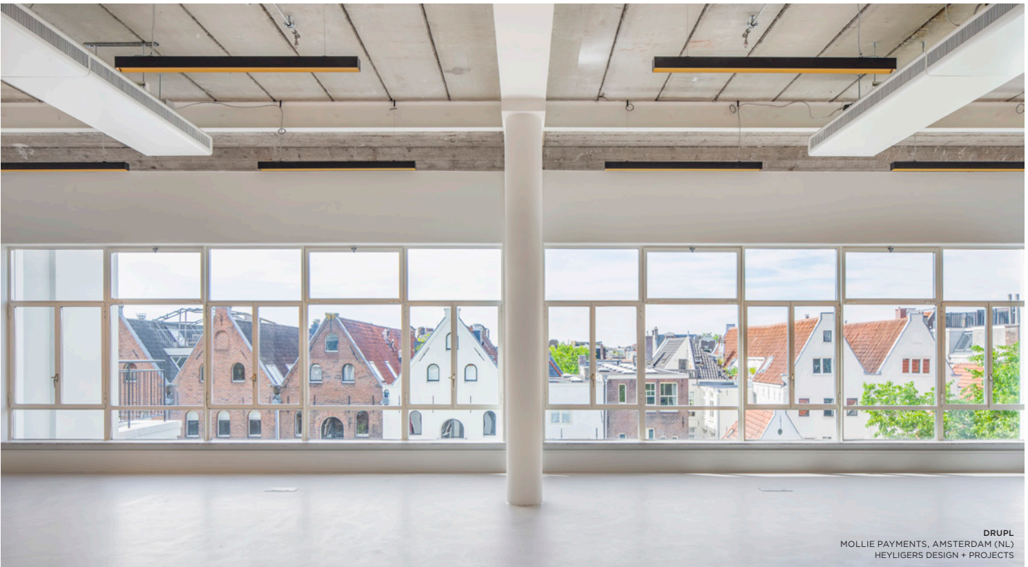
DRUPL MOLLIE PAYMENTS, AMSTERDAM (NL) HEYLIGERS DESIGN + PROJECTS