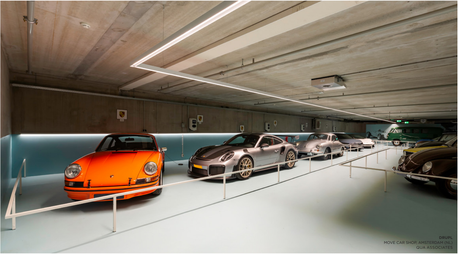
DRUPL MOVE CAR SHOP, AMSTERDAM (NL) QUA ASSOCIATES