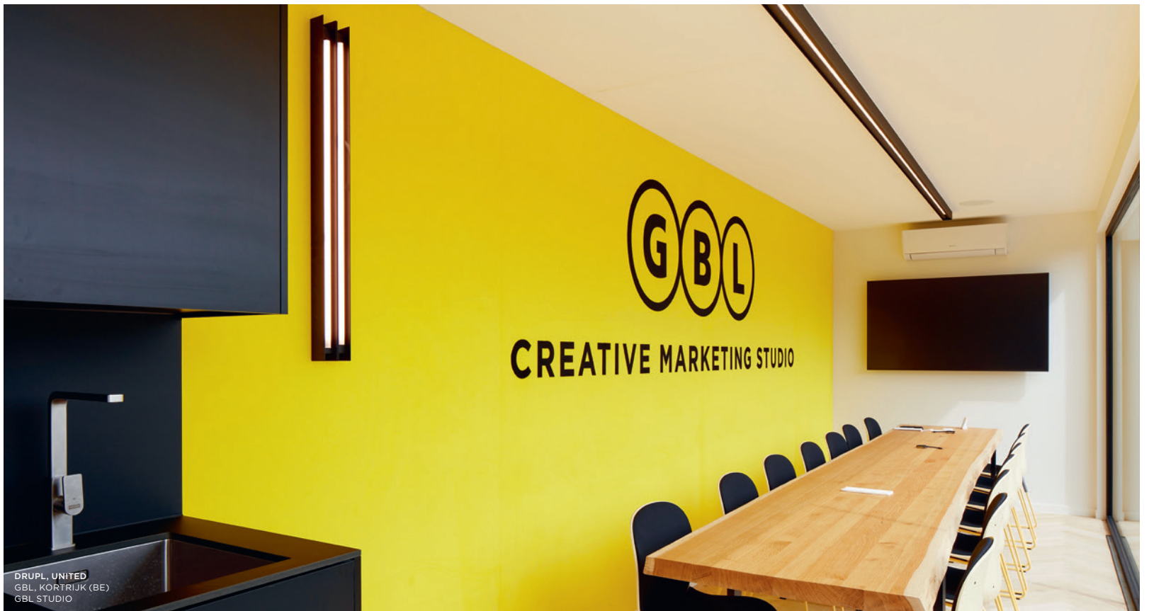
DRUPL, UNITED GBL, KORTRIJK (BE) GBL STUDIO