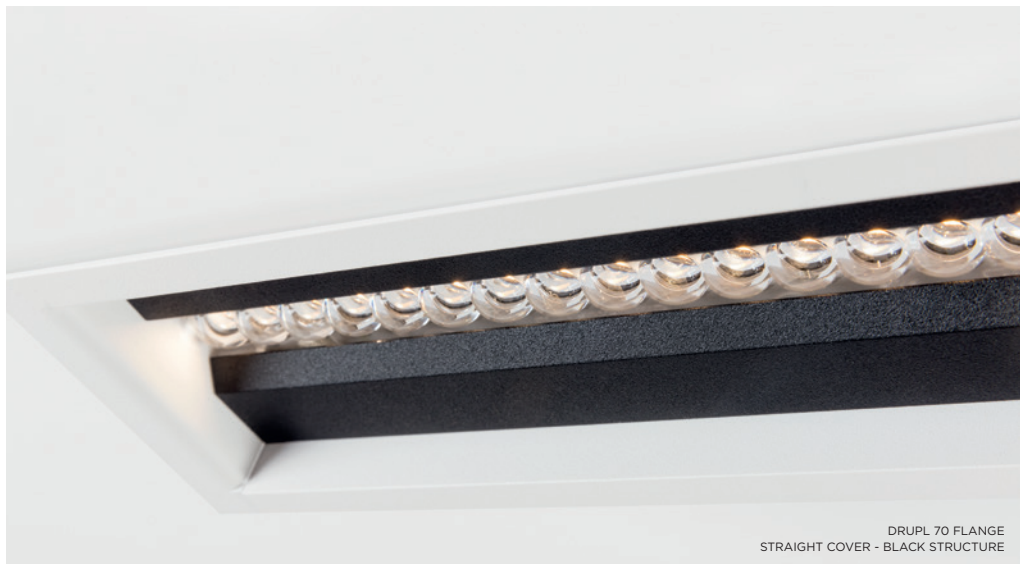
DRUPL 70 FLANGE STRAIGHT COVER - BLACK STRUCTURE